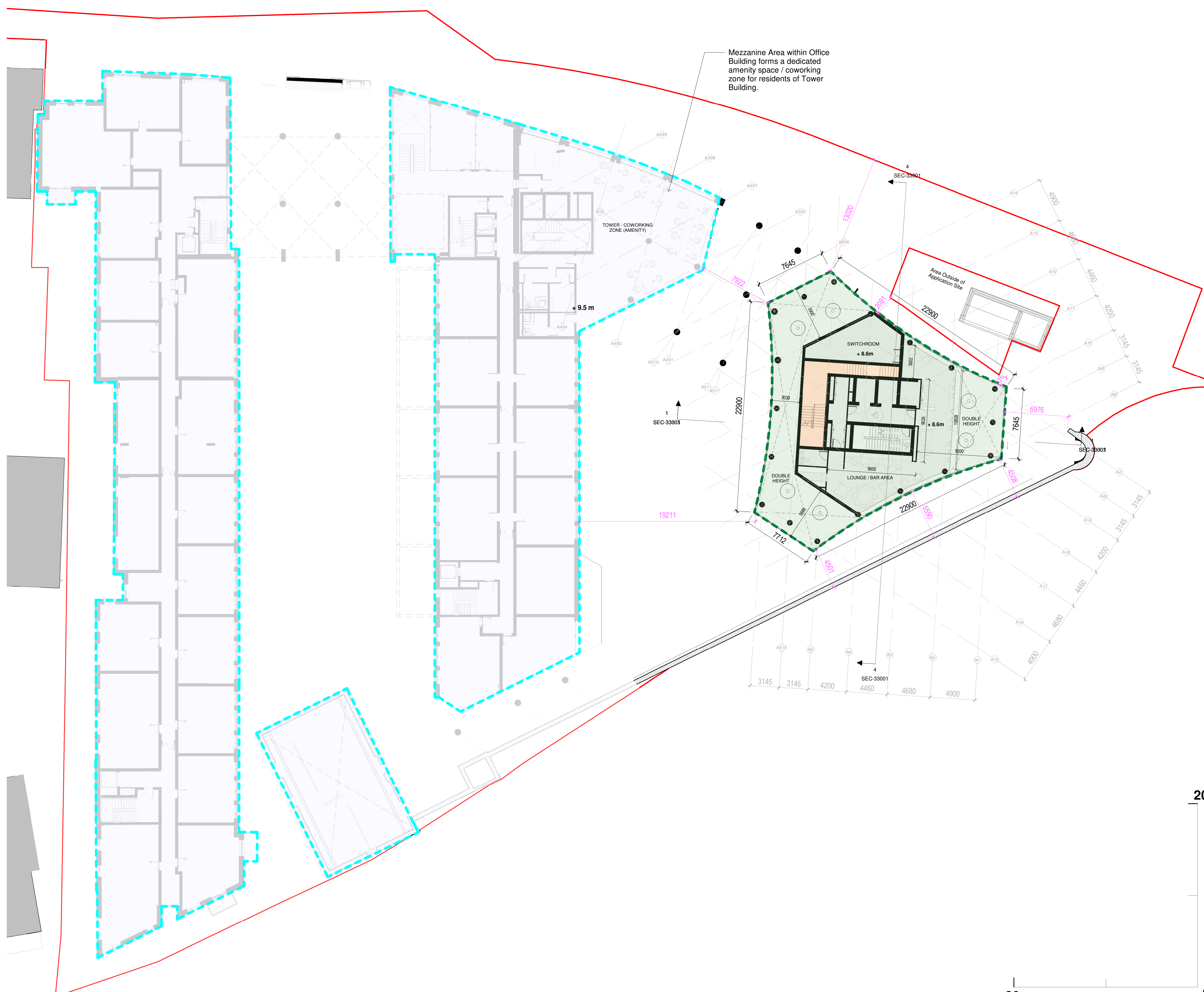
Proposed Mezzanine Floor Plan 1 : 200